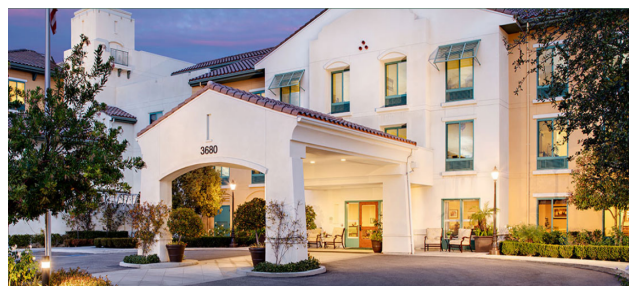
Belmont Village Senior Living Thousand Oaks, California